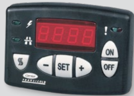
Cab Command™2 shown here

Dimensions: 3.4" x 2.4" x 1.1" (85 x 60 x 28 mm)