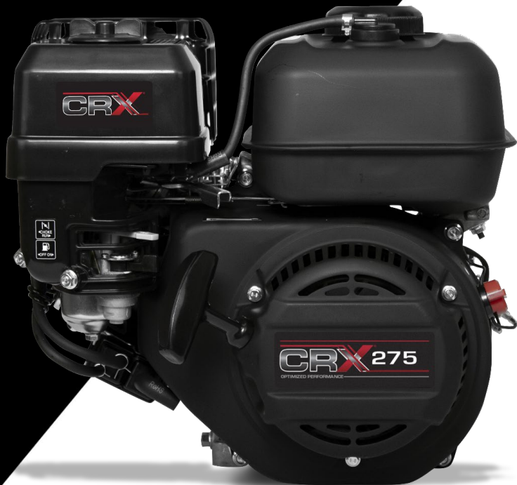
CRX275 SAE J1349 (NET)